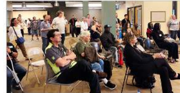
Community partners, public officials, community members, Anawim staff and board, and Full Circle participants gathered together for the event.