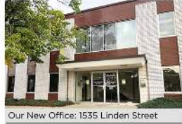
Our New Office: 1535 Linden Street

While the stress of moving offices has slowed, Anawim has also embarked on an organizational change. This August, we moved all of our property management operations under the name of our third-party management entity: Allterra Property Solutions. This change is immediately evident when you visit our new space. Come in the front door at 1535 Linden Street and you'll see a