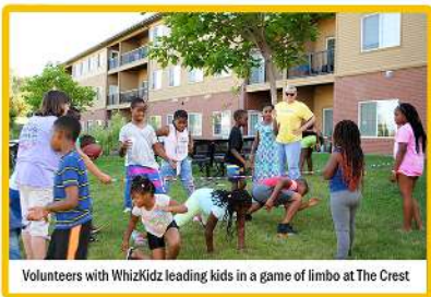
Volunteers with WhizKidz leading kids in a game of limbo at The Crest